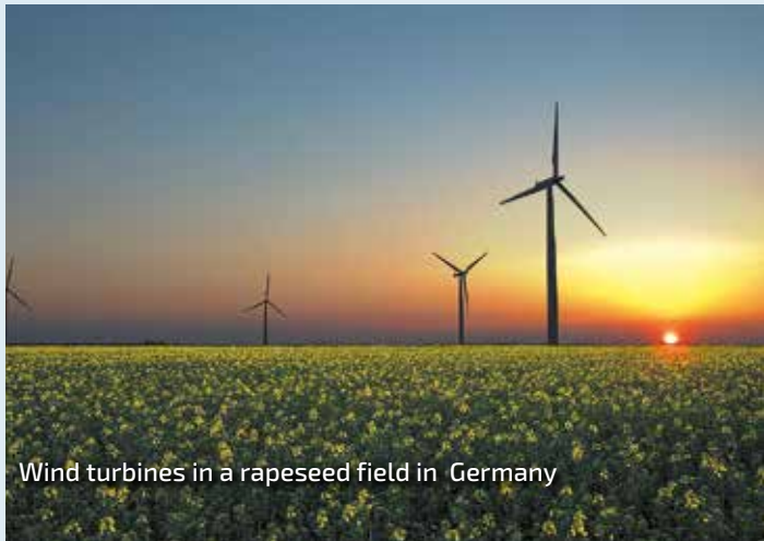
Wind turbines in a rapeseed field in Germany

Renewable energy sources will no doubt be one of the greatest issues our society will have to face in the future. With this Master programme, our aim is to provide international students with a context-sensitive, first-class training in the field of "Renewable Energy Engineering and Management". The M.Sc. REM programme is designed to bridge the current gap between technical aspects of renewable energy and its sustainable implementation at a societal level. To establish this connection, a trans-disciplinary approach is paramount. As an inter-faculty study programme hosted by both the Faculty of Environment and Natural Resources and the Faculty of Engineering, the REM programme stands out for its trans-disciplinary endeavor. Furthermore, its close collaboration with the renowned Fraunhofer Institute ensures a strong connection between research and industry .