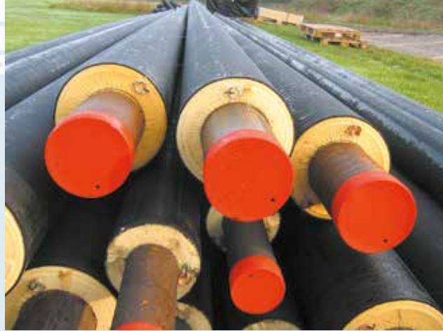
Transportation of energy by underground pipes

Resources and the Faculty of Engineering, as well as internationally experienced representatives from across many different departments of the University of Freiburg and from external research institutes and partner Universities.