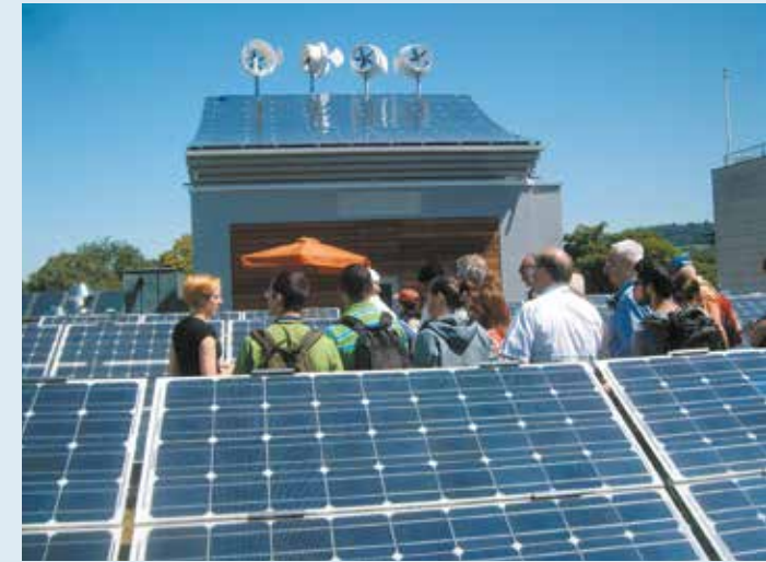
Excursion to a hotel using renewable energies (PV, solar thermal and wind energy)

The programme is addressed to candidates with BSc in: engineering (electrical engineering, energy management, process engineering, microsystems technology, mechanical engineering or environmental engineering), natural sciences or applied life sciences (forest or environmental sciences). Applicants must have well-above-average grades in order to be eligible.