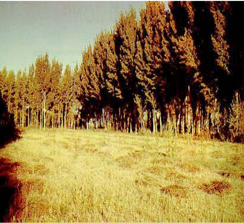
Protective Forest System in Grassland