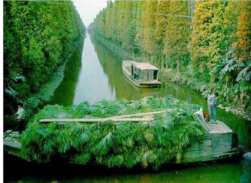
Forest, Network of Farmland in Zhujiang River Delta (Guangdong)