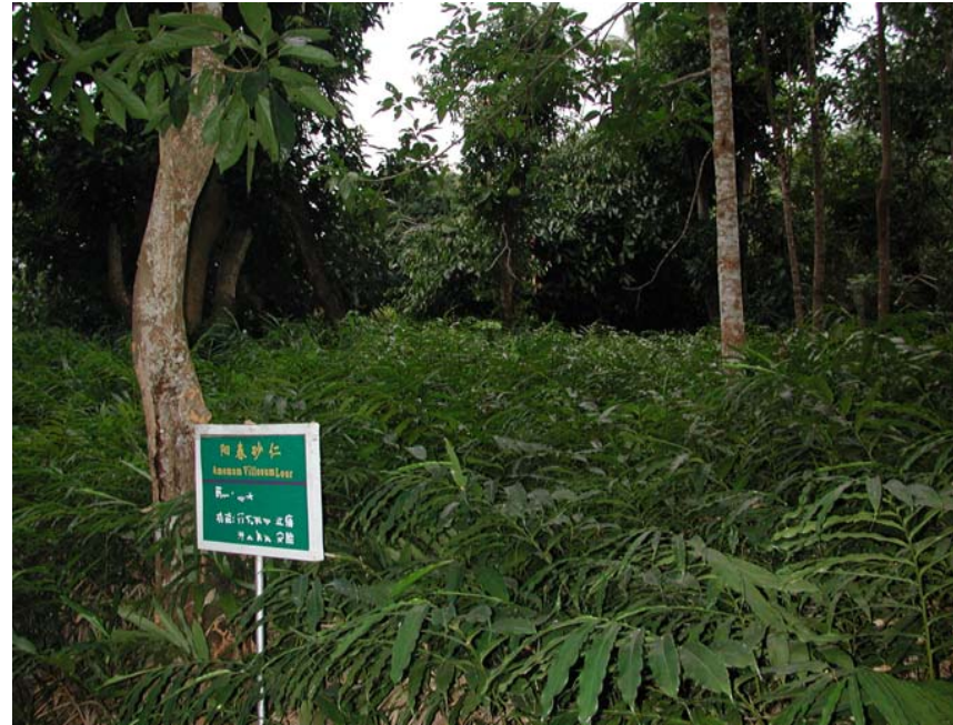
Forest and the traditional Chinese medicinal herbs intercropping