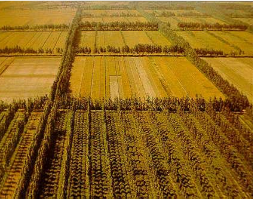
Forest Network and Intercropping in North China Plain (Shandong)