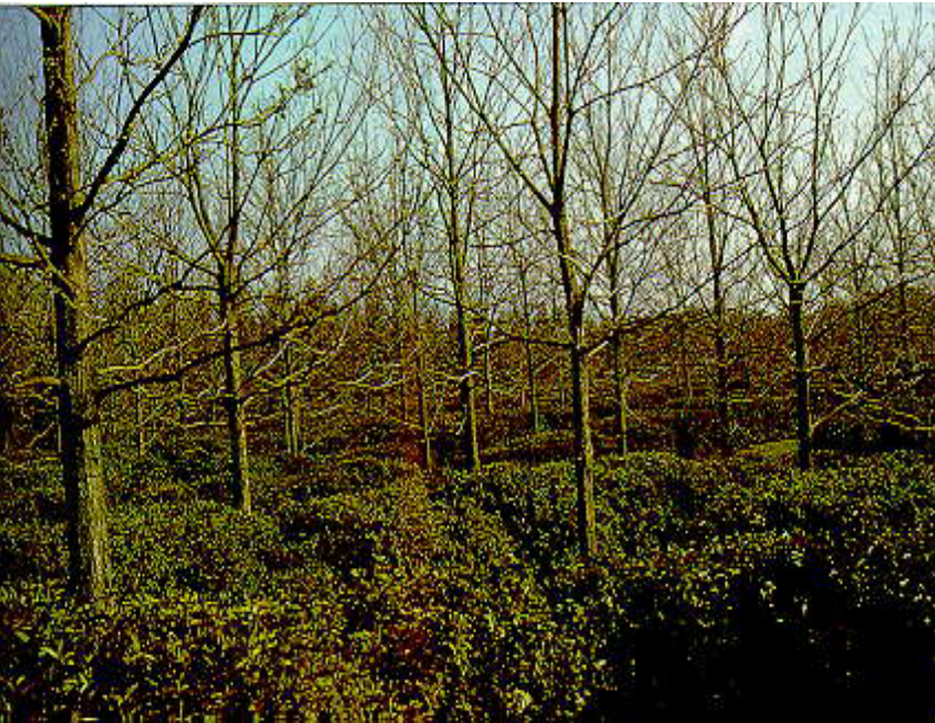
Pecan (Carya illinoensis) - Tea (Camellia sinensis) Interplanting