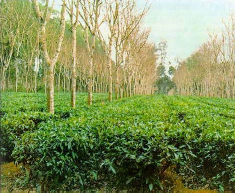
Rubber tree (Hevea brasiliensis) - Tea (Camellia sinensis) Interplanting