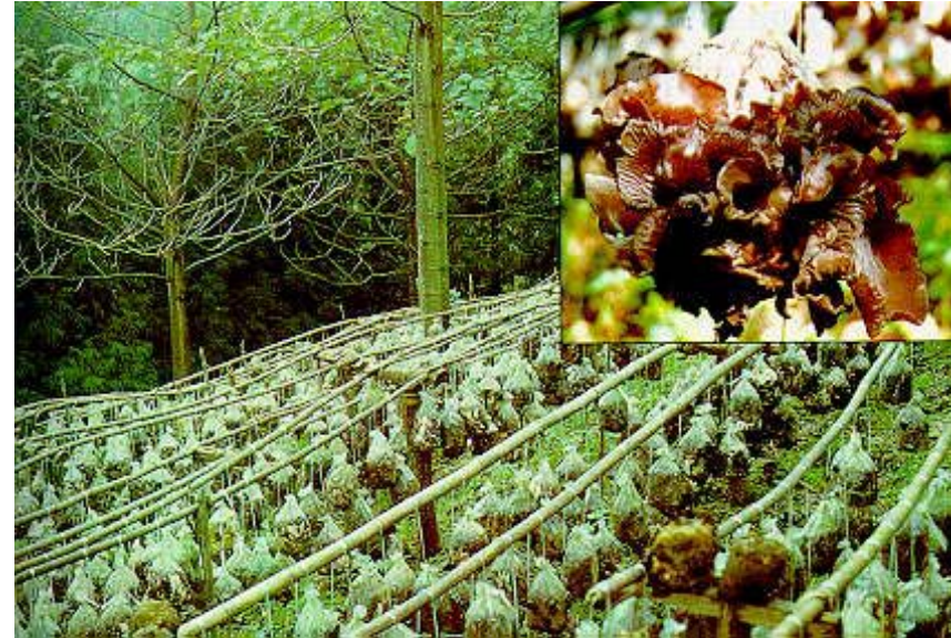
An Ebielle Fungus ( Auricularia auricula-judae ) cultured under Paulownia