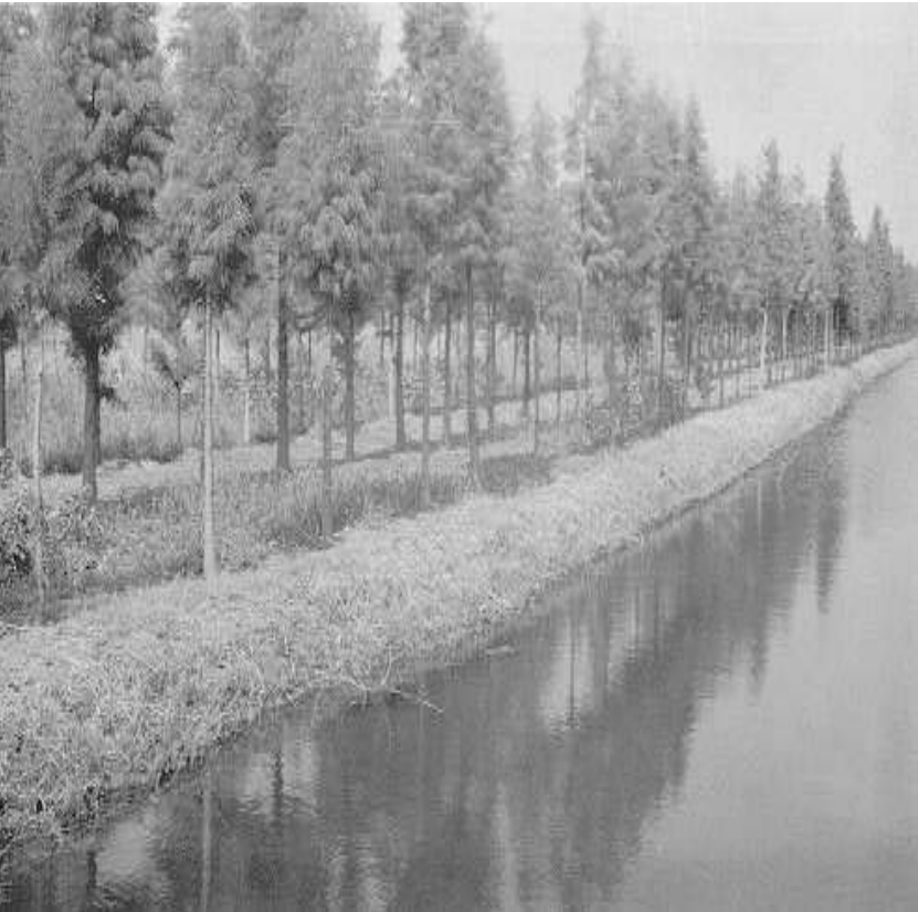
Agroforestry System (Forestry-Fishery-Agronomy) with water canal (Lixiahe, Jiangsu)