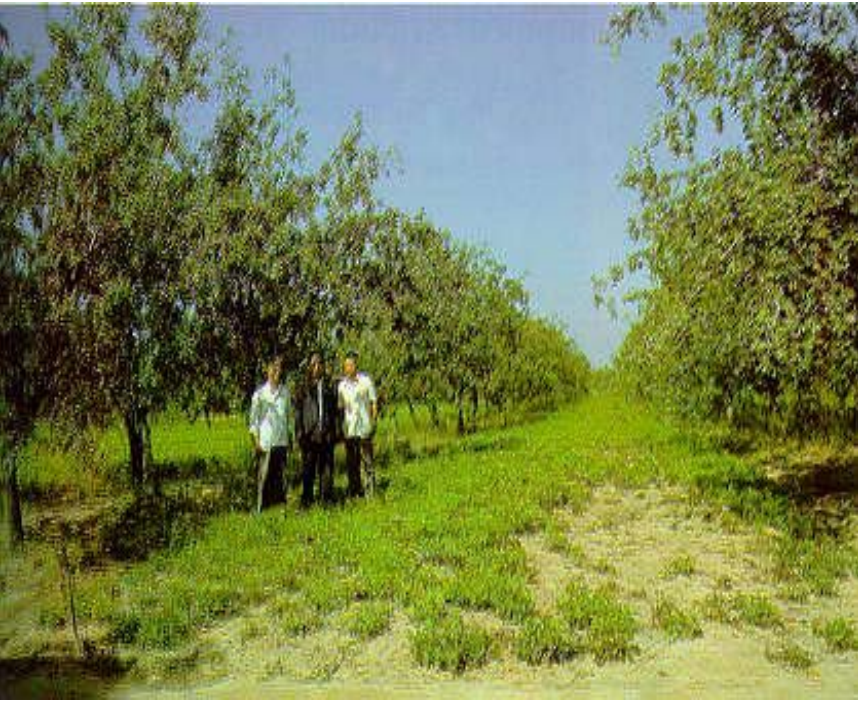
Chinese Date (Ziziphus jujuba) - Peanut Intercropping