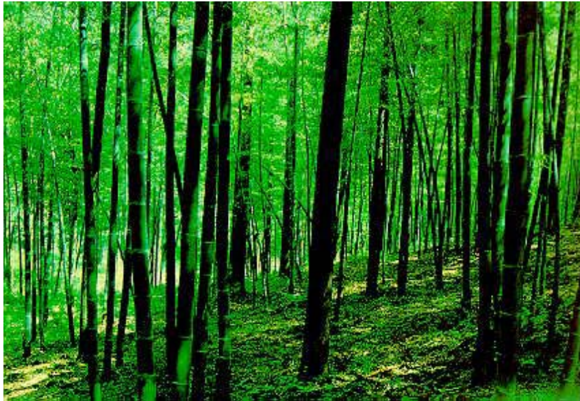
Bamboo ( Phyllostachys pubescens ) - Paulownia ( Paulownia fortunei ) Mixed Plantations (Tongling, Anhui)