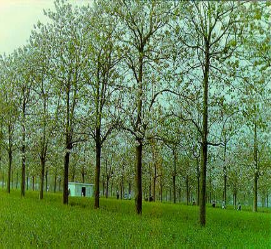
Paulownia (Paulownia elongate) - Wheat Intercropping (Yanzhou, Shandong)