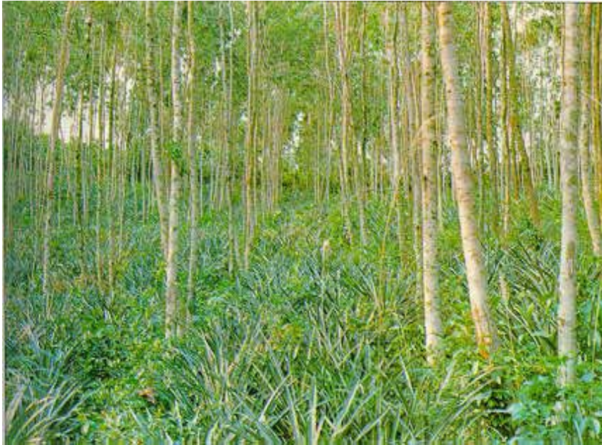
Pineapple Intercropped in Eucalyptus Plantation ( Eucalyptus Leizhou No. 1 ) (Hainan)