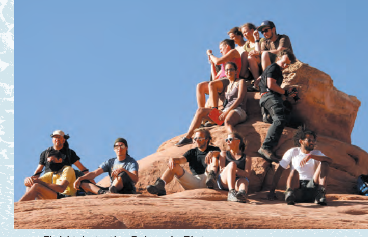
Field trip to the Colorado Plateau

Research focuses on sustainable use and protection of natural resources, the adaptation of ecosystems and human-environment systems to global change, sustainable development, and natural hazards and risks.